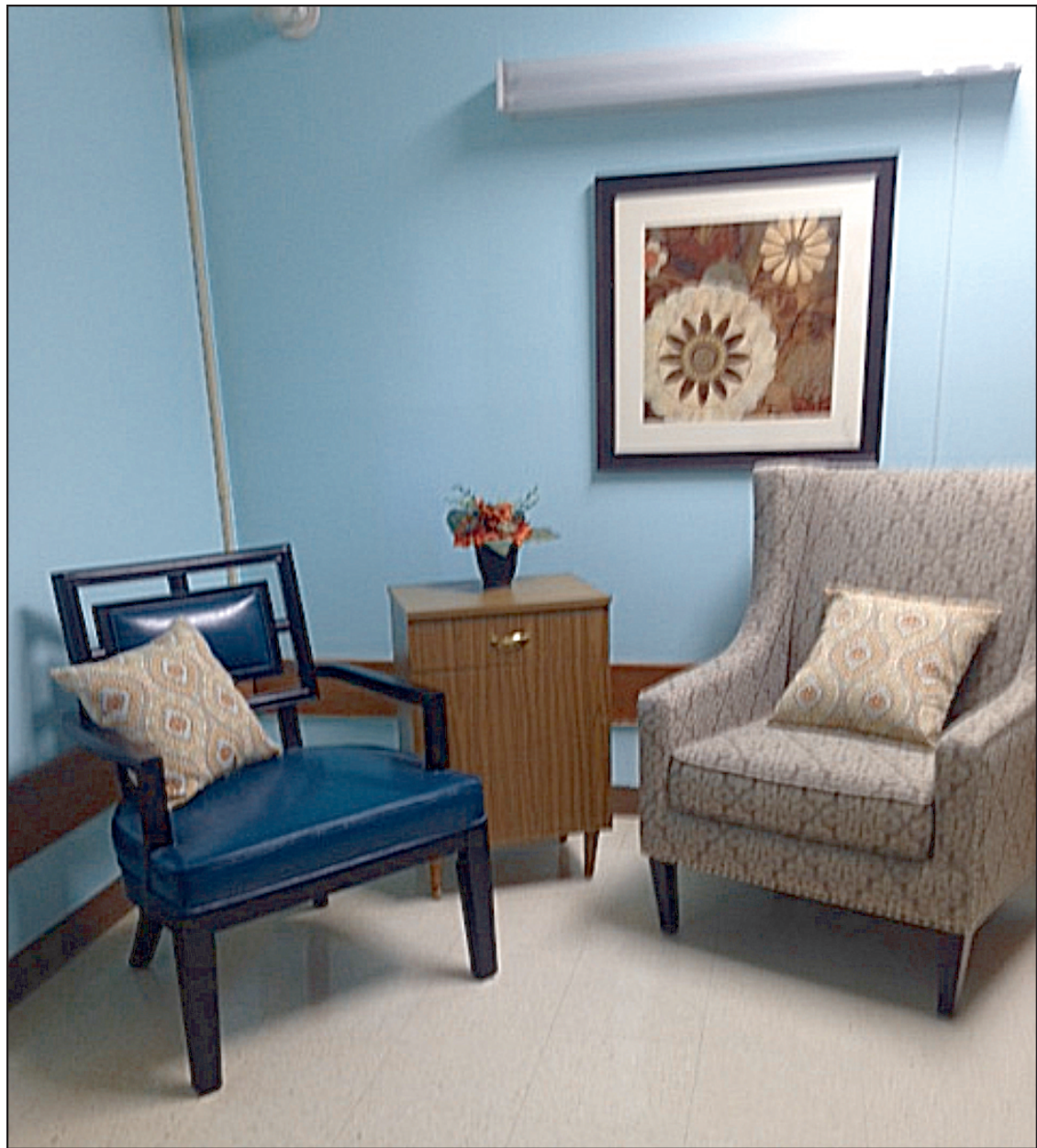
New Rehab Rooms! Through the generosity of the Bronte Health and Rehab Center Auxiliary and Trend Furniture, the Bronte Health and Rehab Center (BHRC) has two newly decorated rooms dedicated for rehab patients. The staff and the auxiliary wanted comfy, cozy, home-like rooms for the rehab patients while they were recovering. This would not have been made possible without the large donation from Trend Furniture. Everyone at the BHRC is quite proud of these rooms and await their next rehab patients.

Charlie Bowers will be catering BBQ plates and will be serving from 11:30 am to 1 pm. Then at 8 pm, come kick up your heels with local country music star Case Hardin.