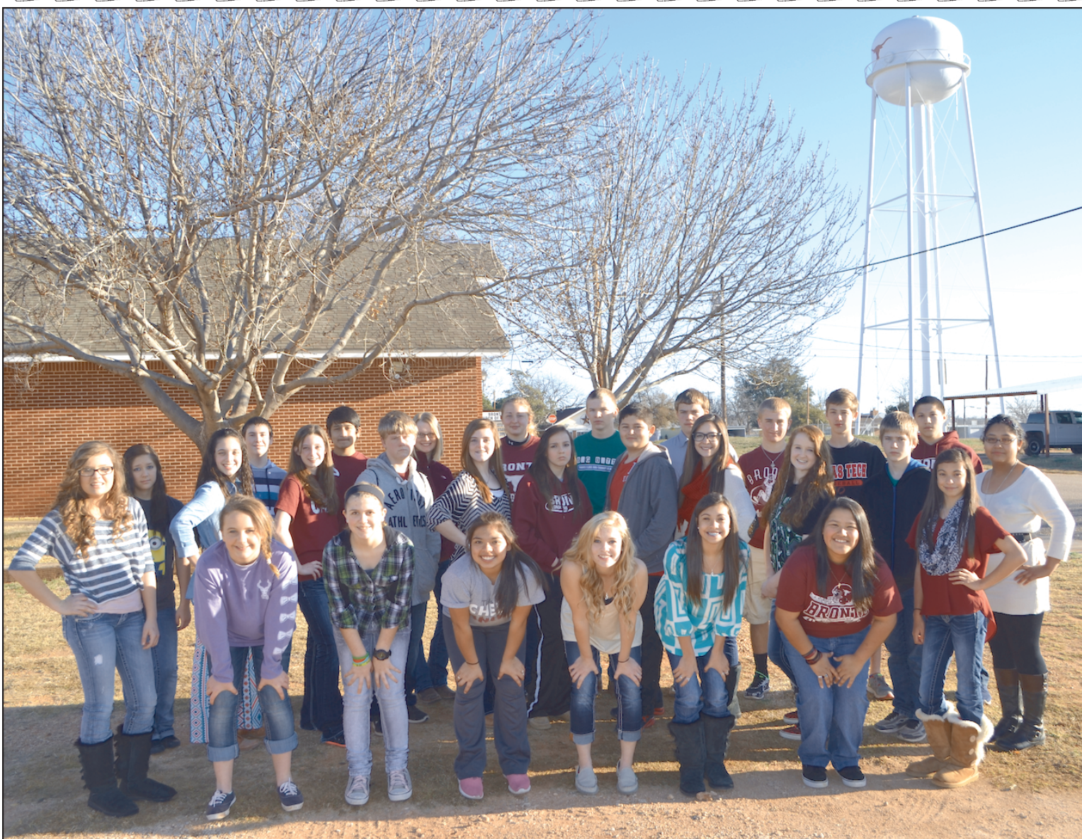
Bronte Class of 2019