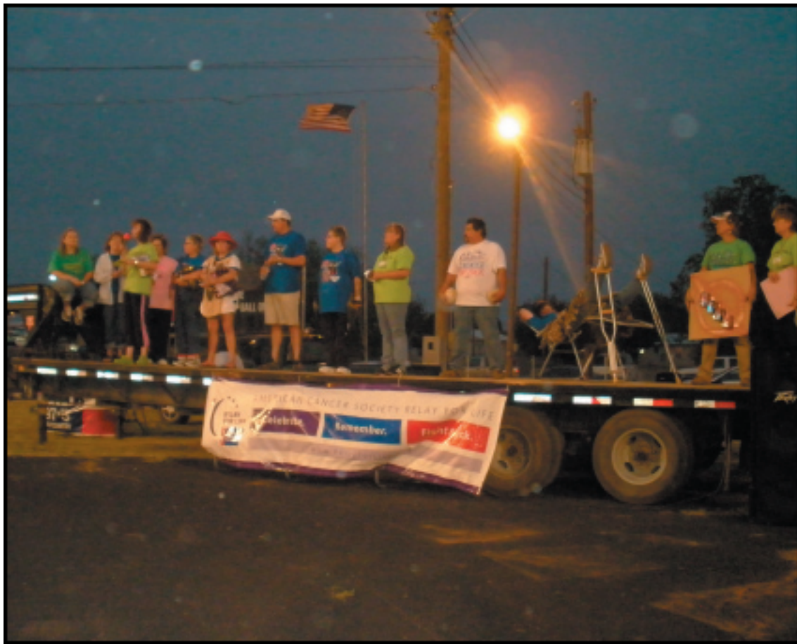
2011 Coke County Relay For Life! Despite West Texas winds, committee and team members present a skit with ways to "Fight Back" against cancer and reduce your risk of getting the disease in a light-hearted way.

The 7th Annual Coke County Relay For Life was held on April 29-30, 2011 in Robert Lee. The event is designed to celebrate survivors, remember those who have battled cancer and to fight back against this dreaded disease plus raise money and awareness for the American Cancer Society. This year over $25,600 was raised to help support the ACS's efforts in the areas of research, education, and patient services. Despite the West Texas wind, seventy cancer survivors were registered and 370 luminaria bags in honor and in memory of those affected by cancer lined the track. Over 1,000 canned goods were collected to be used in the luminaria bags and then donated to the Coke County Food Pantry.