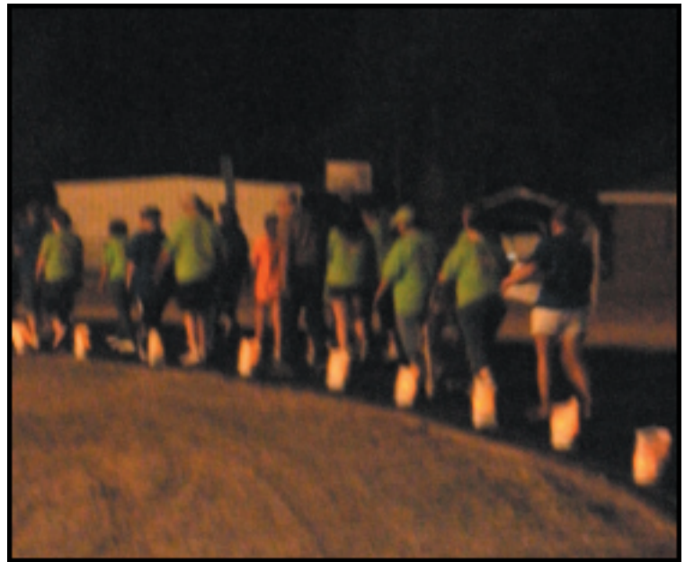
2011 Coke County Relay For Life! Participants at the 2011 CCRFL walk to the light of the luminaria candles that line the track in honor or in memory of those affected by cancer.