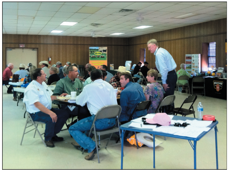
Ranchers Workshop! Over sixty ranchers attended the Ranchers Workshop last Friday, May 17, 2013, at the Community Center in Bronte. The attendees enjoyed visiting with friends and neighbors following noon meal, catered by Kenny Blanek.