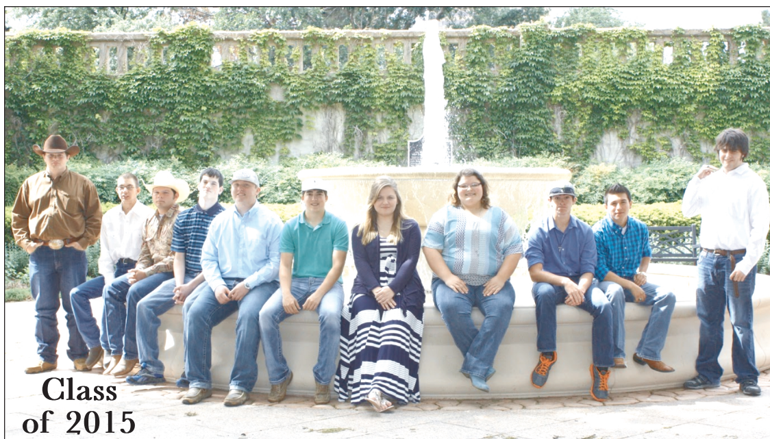
Class of 2015