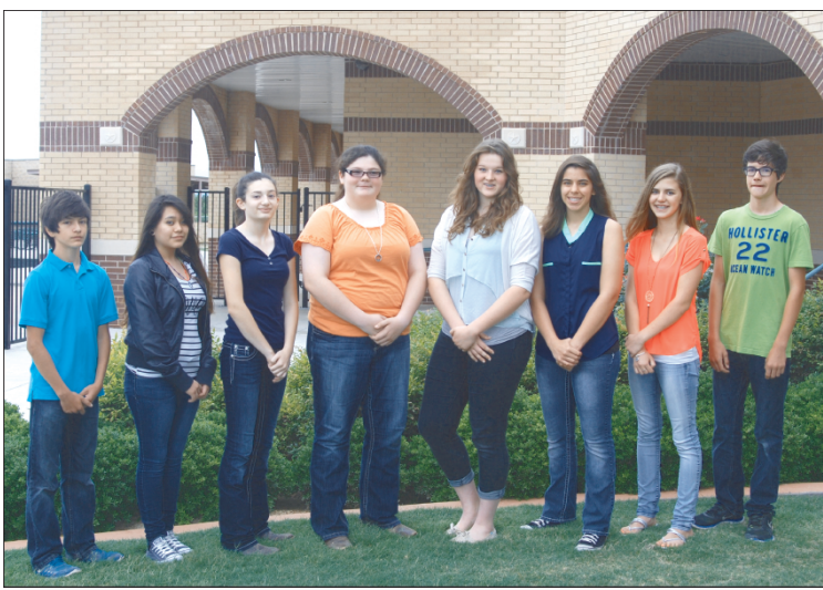
Class of 2019