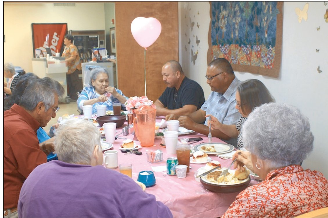
Mothers Day Lunch! Bronte Health & Rehab Center residents (above photo), family and friends enjoyed a special Mothers Day Luncheon.

up June 2-6. Cattlemen will have the chance to vote on an additional dollar from each animal sold to be used for promotion and research of beef. The National Checkoff Dollar brought us "Beef, It's What's For Dinner", defended our product from fanatical groups, and provided research to show that beef is heart healthy, as recognized by the American Heart Association, and proved beef is very good for your total health. The National Checkoff dollar used to promote export markets resulted in $170.00 added value in our pocket for every 550 lb. calf. New cuts of beef, like the flat iron steak, added $100.00 value to each carcass. Cattlemen started The National Checkoff in 1988 and today that dollar has a value of 44 cents. With the national cow herd the lowest since 1951, due to the drought, we are not generating enough money to promote, advertise, and defend our product. Those "Beef, It's What's For Dinner" commercials