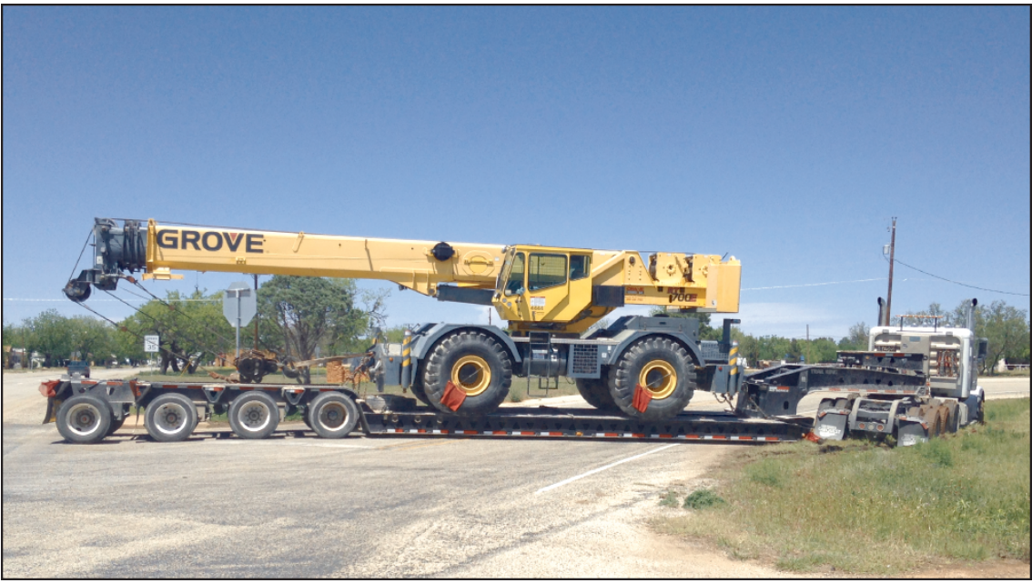
Stuck! This truck hauling a crane missed their turn and ended up getting stuck in the mud when attempting to reach Highway 158 heading east from Bronte.

Per Year in Coke County ... $30.00 Per Year Elsewhere in Texas ... $35.00 Per Year Outside of Texas ... $37.00