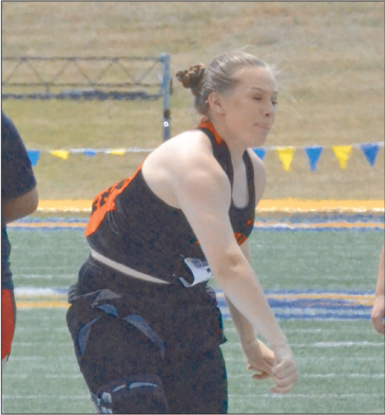
Memorial Day Ceremony - Monday, May 28, at 12 pm

Central Texas State Veterans Cemetery (11463 Highway 195, Killeen TX 76542) Flag Laying - Saturday, May 26, at 8 am Memorial Day Ceremony - Monday, May 28, at 10 am Rio Grande Valley State Veterans Cemetery (2520 South Inspiration Road, Mission, TX 78572) Flag Laying - Saturday, May 26, at 10 am