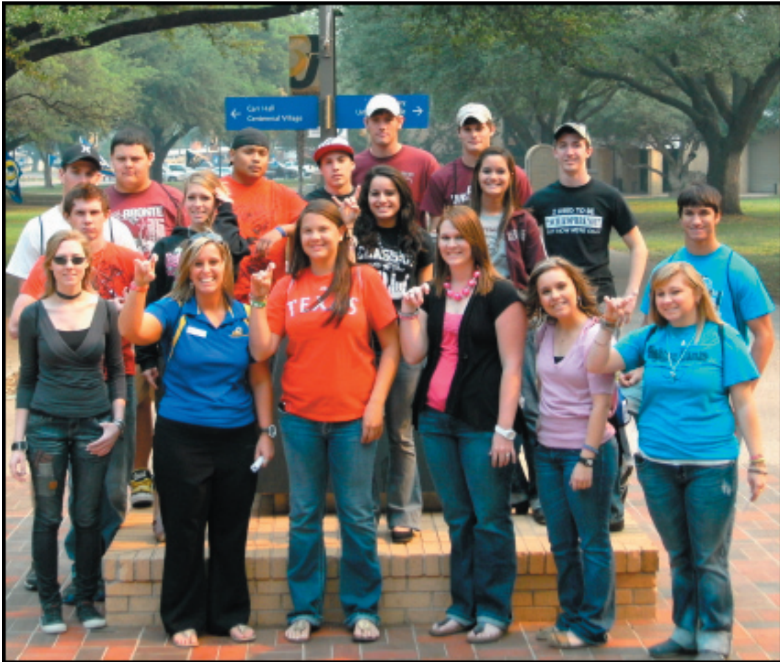
BHS Seniors! The Bronte High School seniors recently took a trip to San Angelo to tour Angelo State University, Texas Workforce Solutions and Howard College.