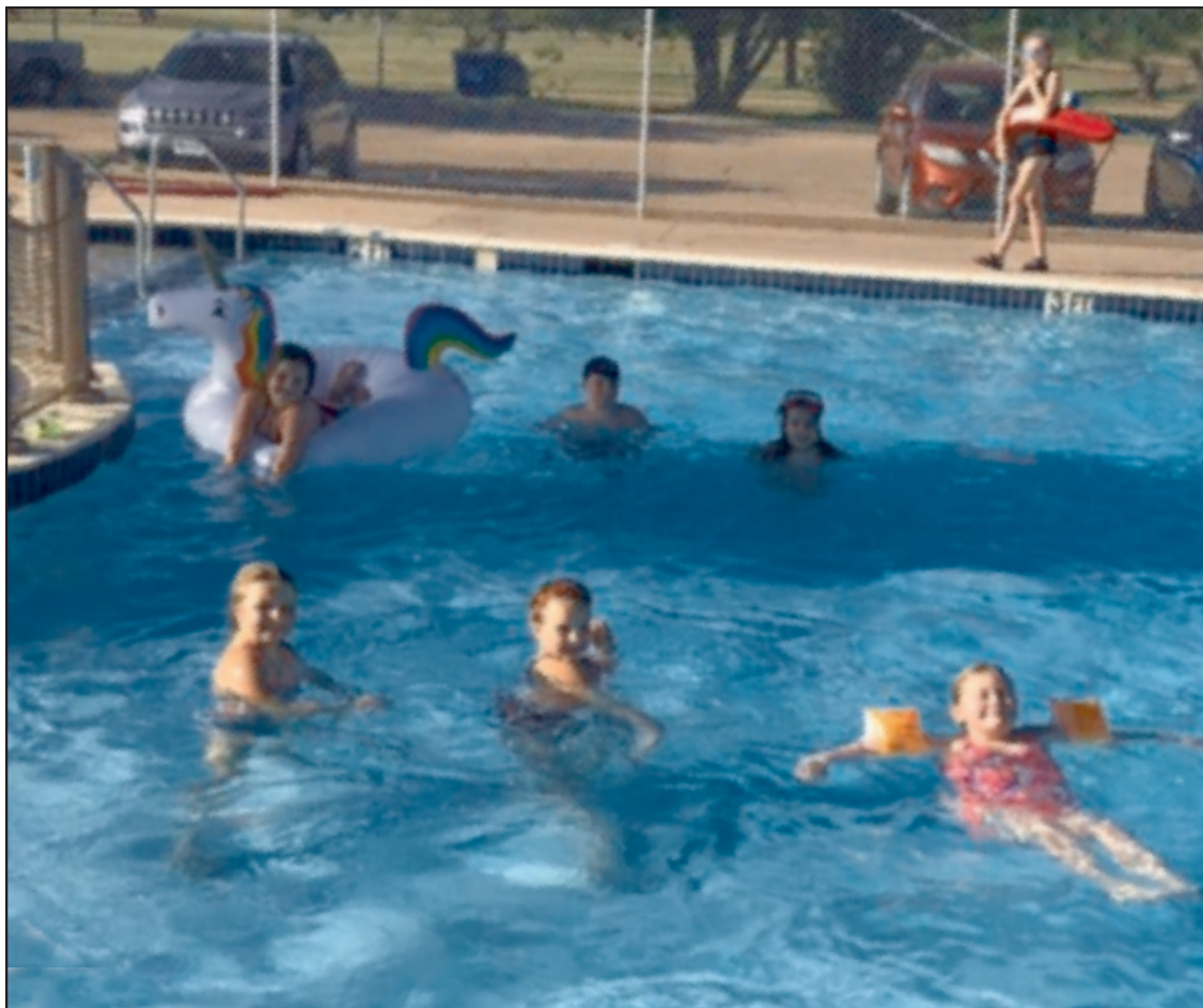
Fun in the Sun! Summer is in full swing as shown by these kids enjoying the cool water at the Bronte Pool recently. With the soaring temperatures recently, the county pools are a great way to beat the heat.

Concho Valley Workforce Solutions will hold a Virtual Job