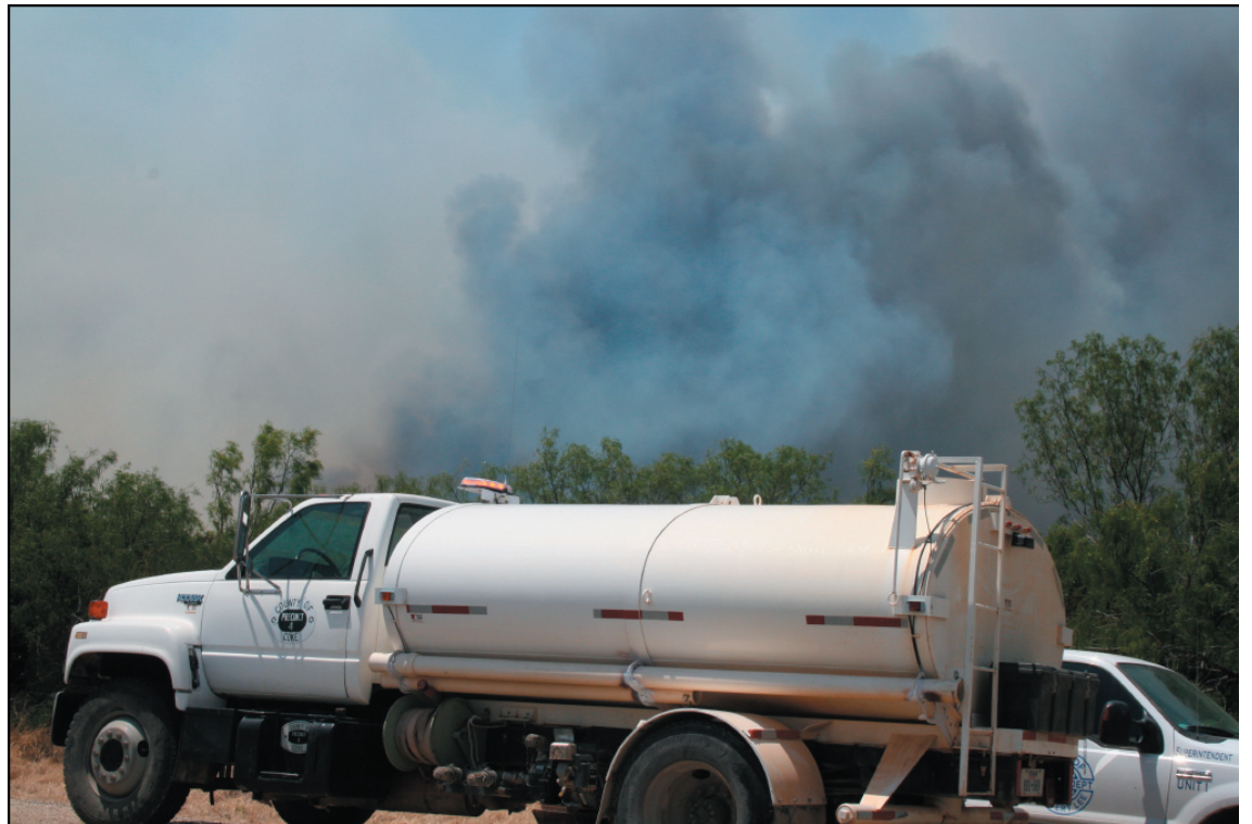
County Employees on the Fire Line Once Again! Employees from Coke County Precinct 4 were on the scene of the Dos Amigos fire Wednesday afternoon. This photo shows the fire as it rolls up the hills on the north side of State Highway 158 west of Robert Lee approximately 15 miles. The fire began that morning on the Dos Amigos Ranch on the south side of Hwy 158. Before it was contained, it moved into both Sterling and Mitchell counties.

is accepting proposals for one 300 barrel water storage tank to be removed by buyer. For details, contact the