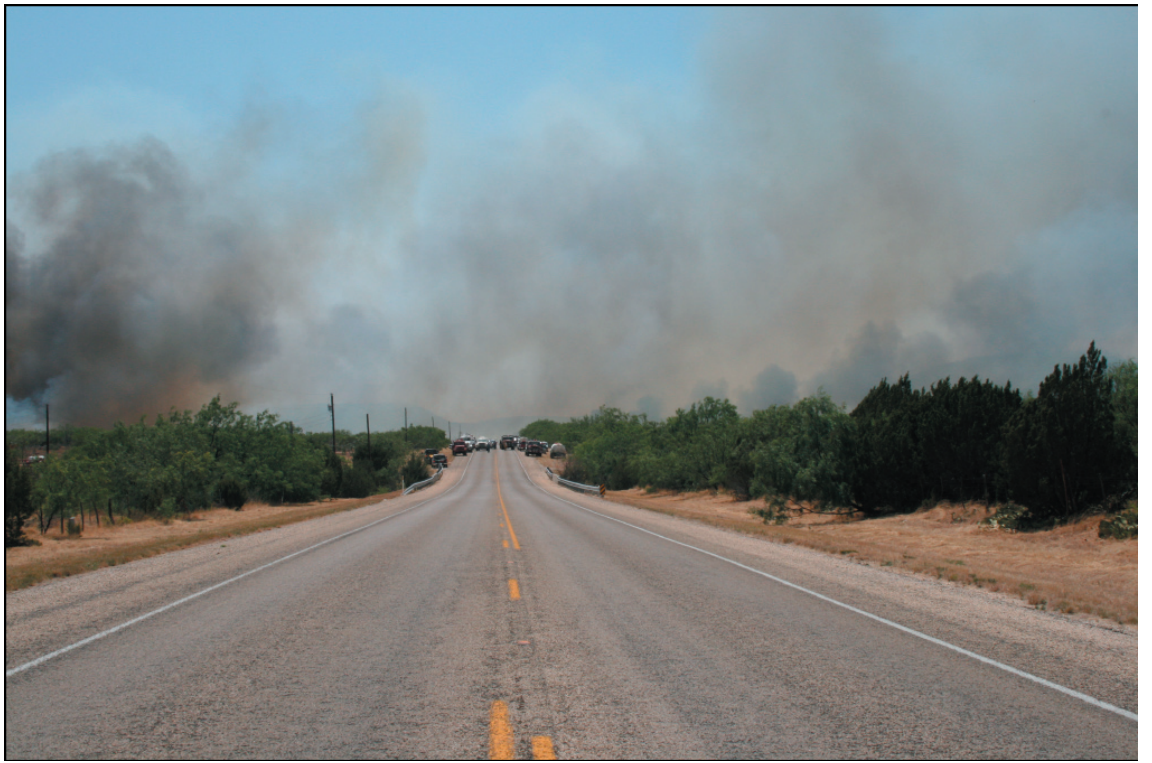
Dos Amigos Rages Early On! The Dos Amigos fire rages on both sides of State Highway 158 approximately 15 miles west of Robert Lee Wednesday afternoon.