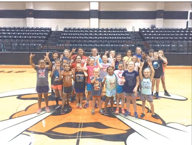
Basketball Camp! These children began their summer by attending the Lady Steers Basketball Camp.