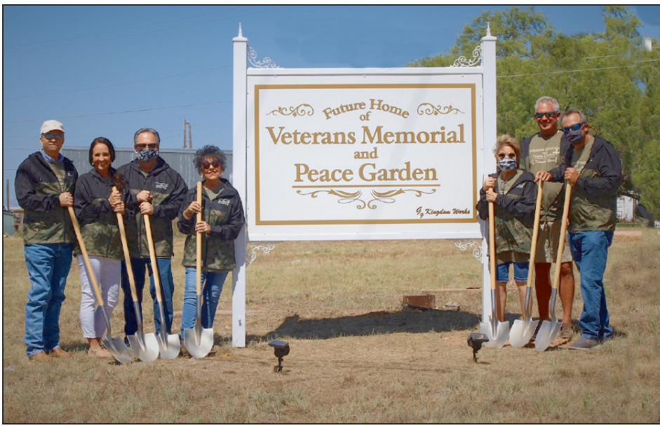
Groundbreaking! Gg's Kingdom Works held a groundbreaking ceremony on Thursday, June 11, 2020, for their Veterans Memorial and Peace Garden. The memorial and garden is located at the corner of Austin Street and 9th Street in Robert Lee.