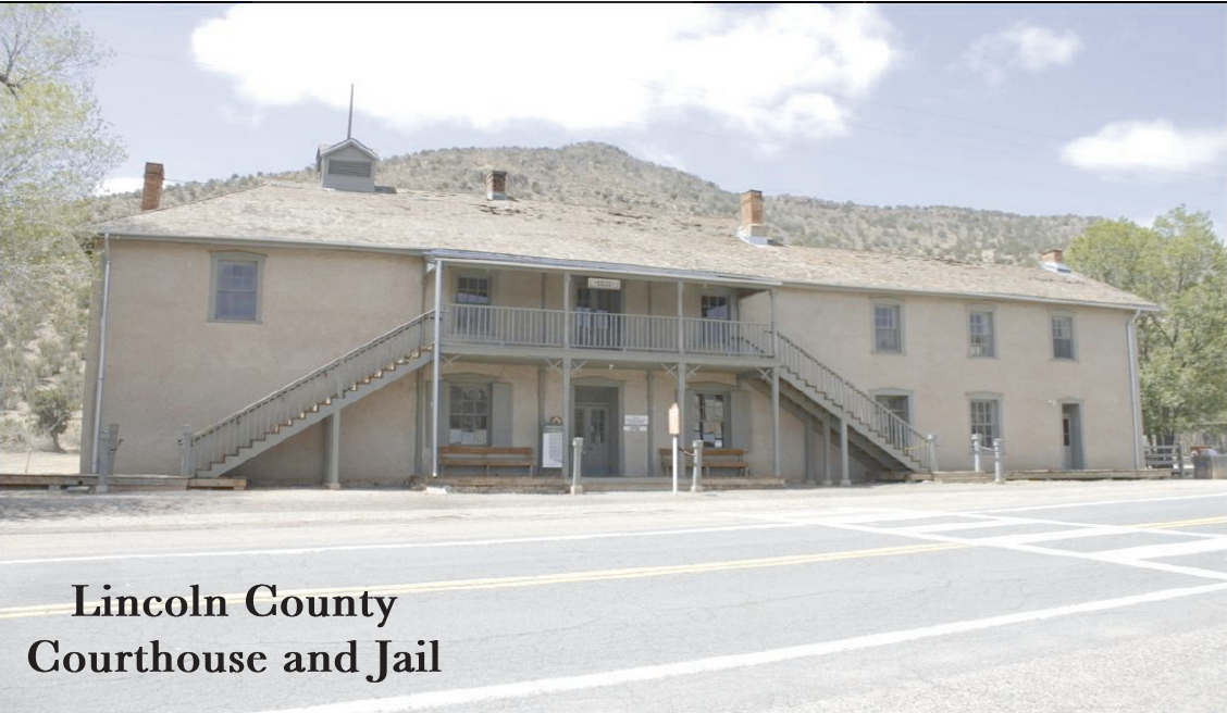
Lincoln County Courthouse and Jail

The Fort Stanton Historic Site is a must-see attraction when visiting Lincoln County. Nestled on Highway 220 that bisects the Billy the Kid Scenic Byway, New Mexico’s newest historic site features over 155 years of southwestern history ranging from its initial creation as a military garrison to its significance as the first tuberculosis hospital in the state, to an internment camp for German seaman during World War II. This 150-year-old pre-Civil War fort (1855) was home at one time to Kit Carson, the Buffalo Soldiers, ‘Black Jack’ Pershing, German prisoners, Geronimo and Billy the Kid. Fort Stanton, Live is set this year for July 14. This event brings costumed reenactors from the Civil War and Indian Wars era to the Fort for demonstrations, presentations, concert and a military ball which will have visitors dancing into the night. Additionally, the event brings authors, historians, photographers, artists, and a variety of historical vendors to site to share their crafts and other handiwork. Local food vendors are on hand to provide sustenance for your day at the Fort as well, so bring a healthy appetite for knowledge, food and fun. Lincoln Historic Site – Billy the Kid This National Historic Site is considered by many historians to be the most authentic old west