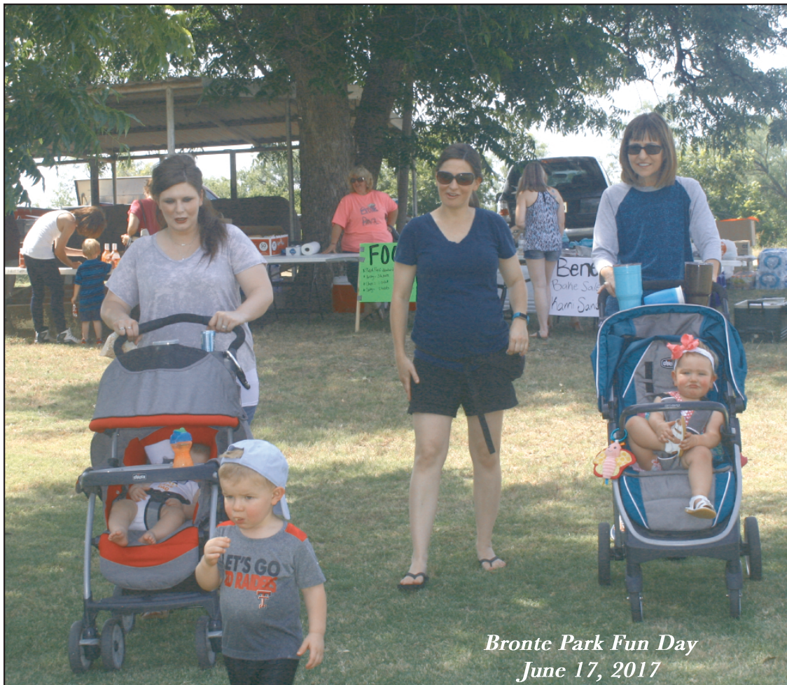
Bronte Park Fun Day June 17, 2017