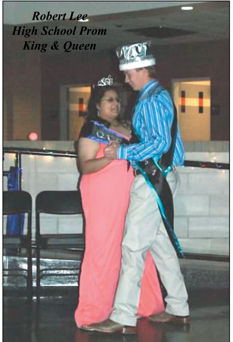
Robert Lee High School Prom King & Queen