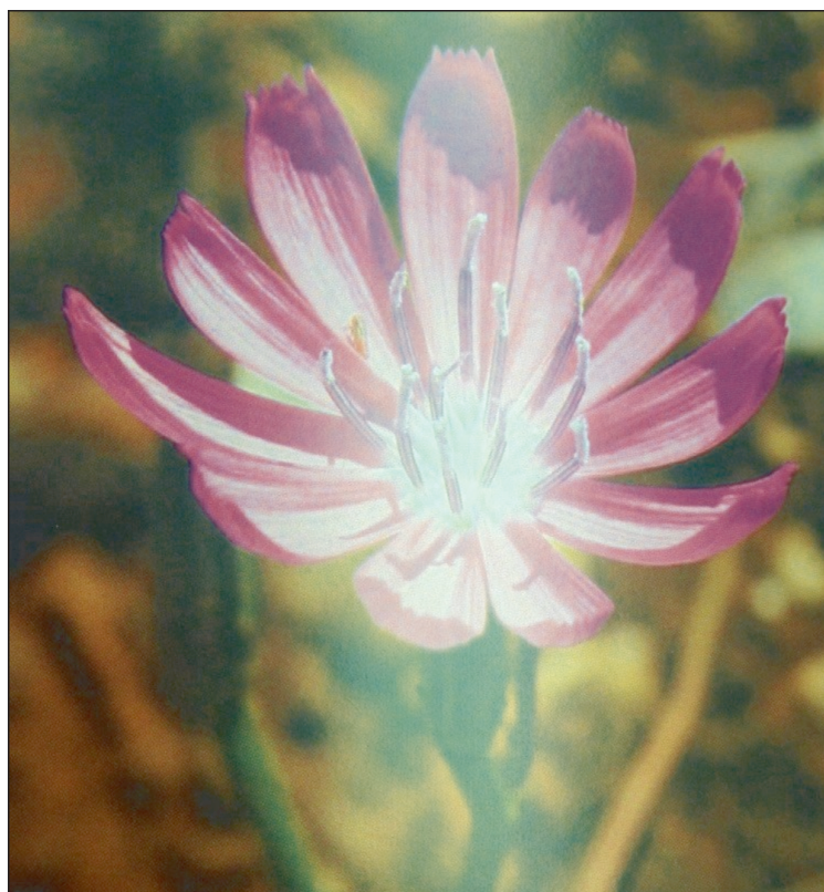
Beautiful Flowers! The Indian Blanket (right photo) has red petals that are tipped in yellow, a common wildflower providing beauty along the highways. The Texas Skeleton plant (left photo) is an unusual wildflower since it is mostly leafless but blooms a pretty, lavender flower.