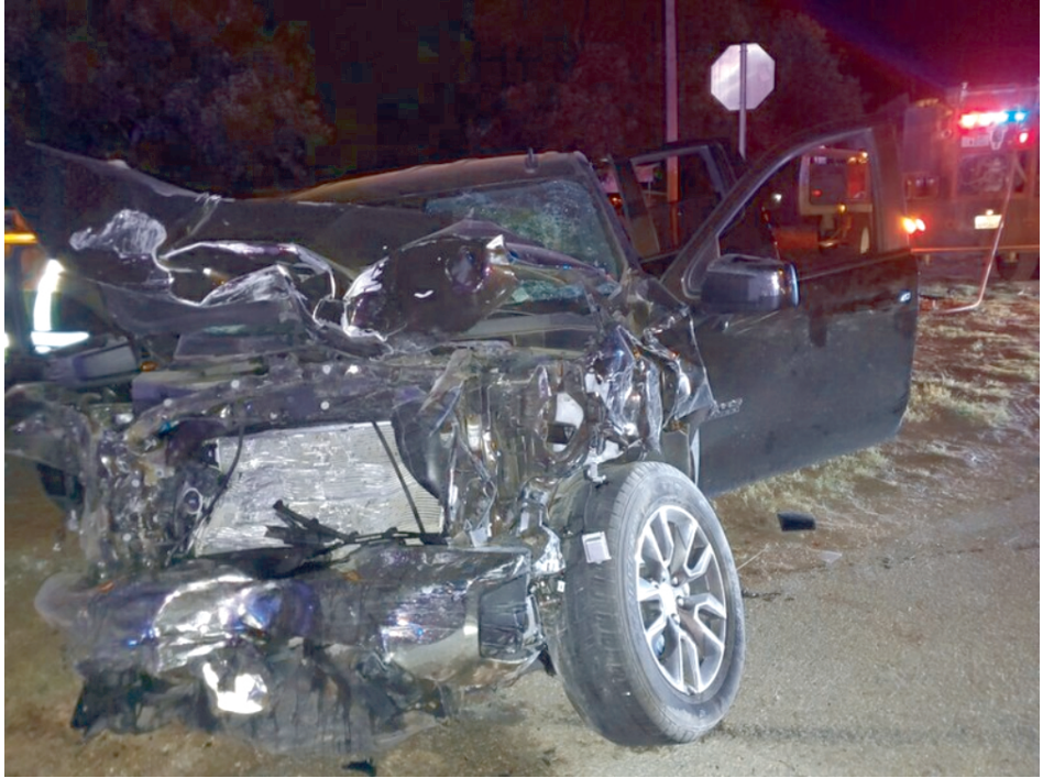
Vehicle Accident! At about 10 pm, Saturday, June 27, 2020, two vehicles crashed on State Highway 208, near the intersection of East 7th Street in Robert Lee. Three people from one vehicle and one person from the other vehicle were injured. An eleven year old was transported to Shannon Hospital by AirMed and the other three victims were transported by West Coke County EMS and East Coke County EMS. Two young people were subsequently transferred to Cook's Children's Hospital in serious condition. Texas Department of Public Safety has charged a San Angelo man with three counts of Intoxication Assault.

8.52% of all Texans tested are confirmed to have Covid-19. 1.28% of all confirmed Texas cases of Covid-19 are fatal.