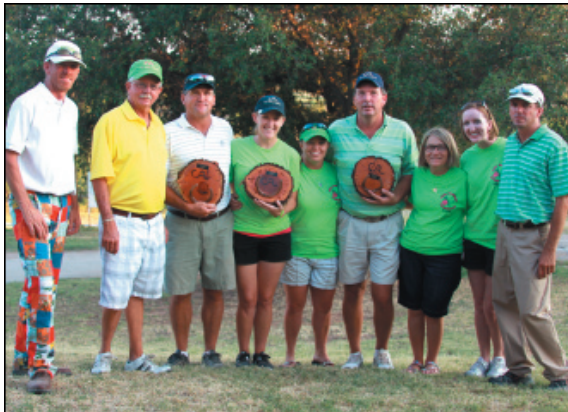
1st Flight - 2nd Place