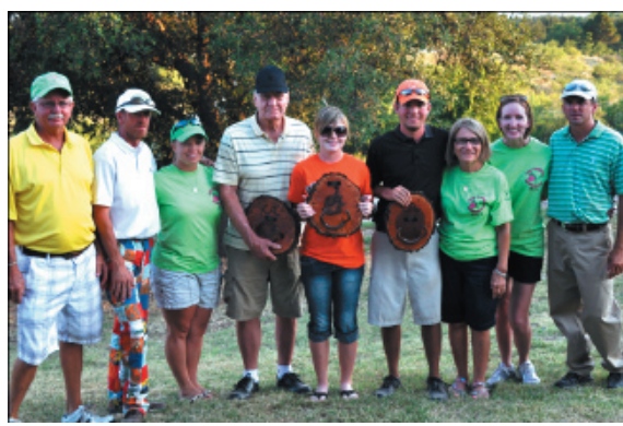
3rd Flight - 1st Place