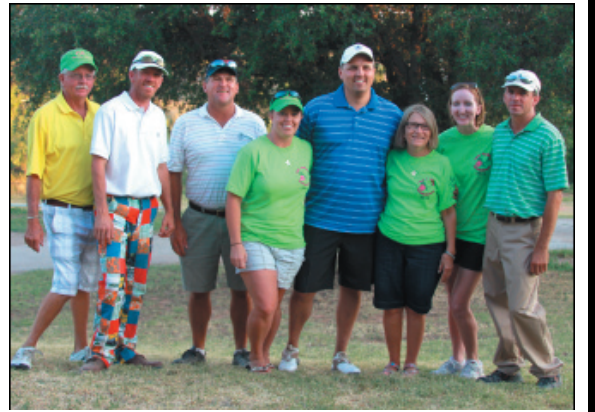
Closest to the Pin • Longest Drive