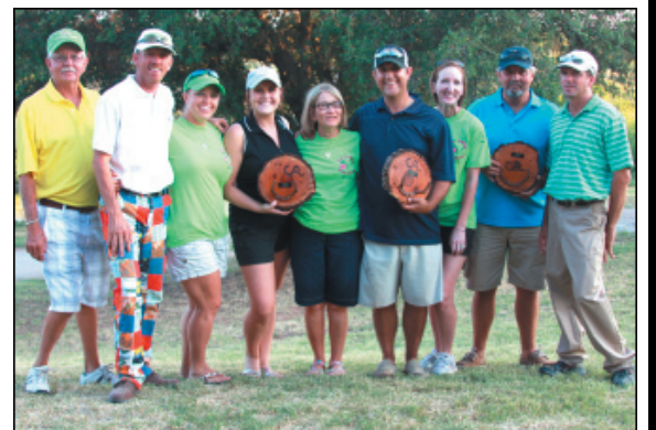
Git 'er Done Trophy