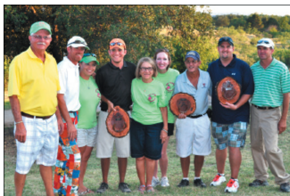
3rd Flight - 2nd Place