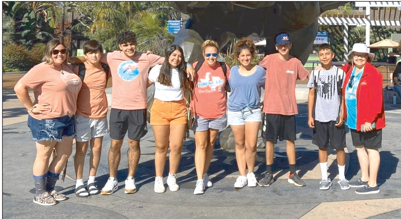
FCCLA! Robert Lee High School FCCLA made the trip to San Diego, California, to attend the National Leadership Conference, held June 29 - July 3, 2022.