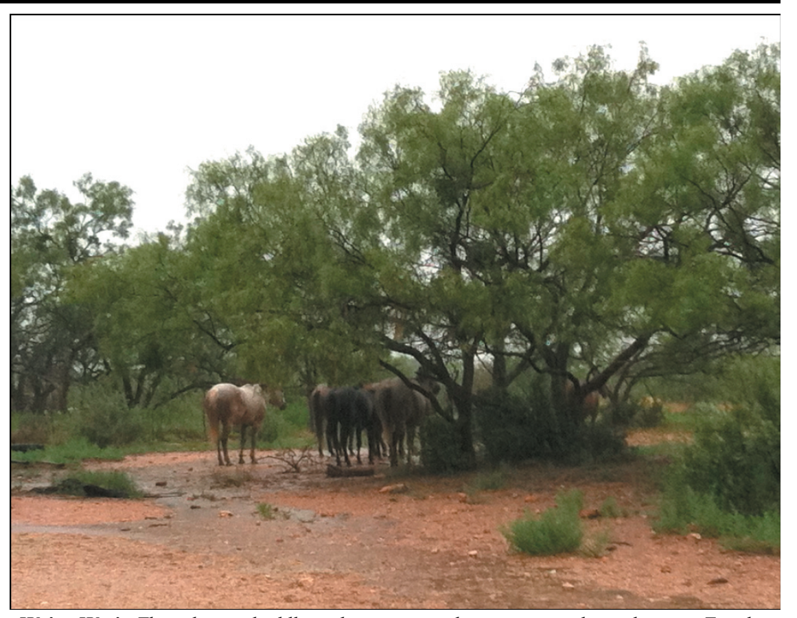
We're Wet! These horses huddle under a tree as the rain pours down this past Tuesday morning. The rain began early Monday morning, July 15, 2013, and has fallen off and on through press time. Monday's total ranged from just over an inch to over two inches. Tuesday morning's downpours were averaging an inch an hour for awhile.

There will be a city-wide fish fry using the fish caught starting at 4 pm fol-The First United lowing the tournament. Methodist Church of Plates will be by donation Bronte will be having to the fire department.