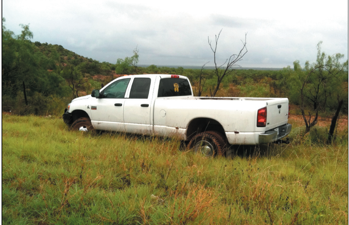
Slip and Slide! This Dodge dually ended up next to the fence on Highway 208 approximately 4 miles south of Robert Lee Tuesday morning.