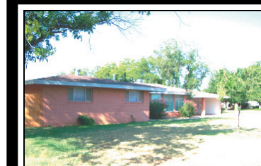
WOODLAWN ADDITION! 4 Bedroom 2 Bath Home! Large Living Area with Bamboo flooring! Ceramic Tile in Formal Dining Area & Den! Established yard with Privacy fence!

Get your Lake Spence Permits ($5/vehicle/day) at CINDY'S 409 W. 10th Robert Lee 453-9200