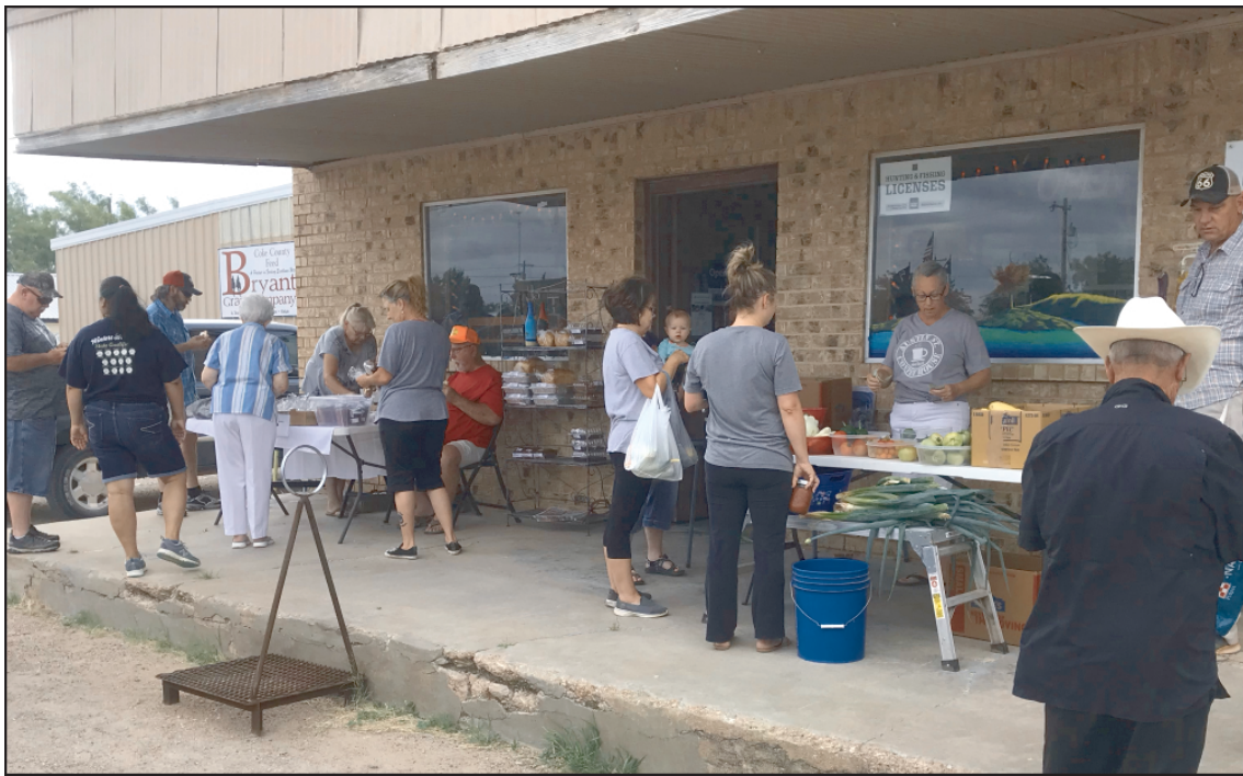
Farmer’s Market! There was quite a turnout at the Farmer’s Market on Saturday, June 26, 2021, at Coke County Feed & Ranch Supply in Robert Lee. The market is scheduled for each Saturday this summer. All vegetable growers in the county are welcome to sell their wares in the morning shade on the porch of the feed store from 9 am until 12 noon.

at Czech Stop Bakery and take a selfie at Blue Bonnet Café with a slice of any of their piled-high pies. Visit GOSH 2021 Central Texas Region for more information. In the Houston area, avoid being devoured by a carnivorous plant at Big Thicket Natural Preserve and take a selfie splashing in the water at Lake Livingston State Park. Grab a photo outside any of Moody Garden’s three glass pyramids and climb the tower observation deck at Sheldon Lake State Park. Find the geyser at Spindletop-Gladys City Boomtown Museum and take a top-notch self-portrait in front of La King’s Confectionary taffy pull. GOSH 2021 Houston Area has more details. In the Panhandle, snap a selfie in front of the iconic Alibates Visitors Center at Alibates Flint quarry and pose in front of a bison statue at Caprock Canyons