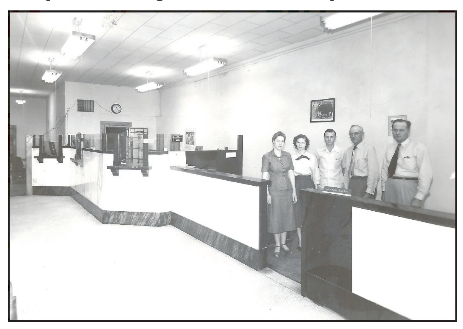
The bank was housed in a building at 707 Austin (now The Observer/Enterprise) before moving to its present location at the corner of Austin and 7th Street. The building (below, left) was replaced by our current building.