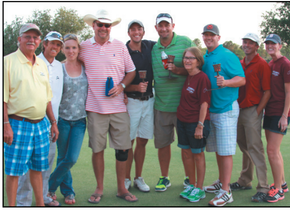
2nd Flight - 1st Place (Tie)