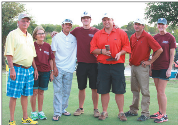
Longest Drive • Closest to the Pin