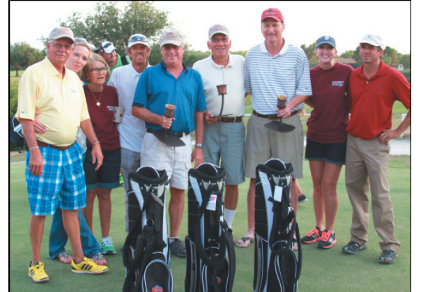
3rd Flight - 1st Place (Tie)