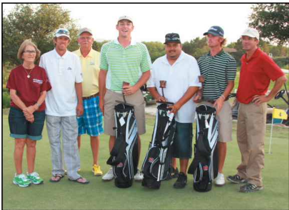
1st Flight - 1st Place