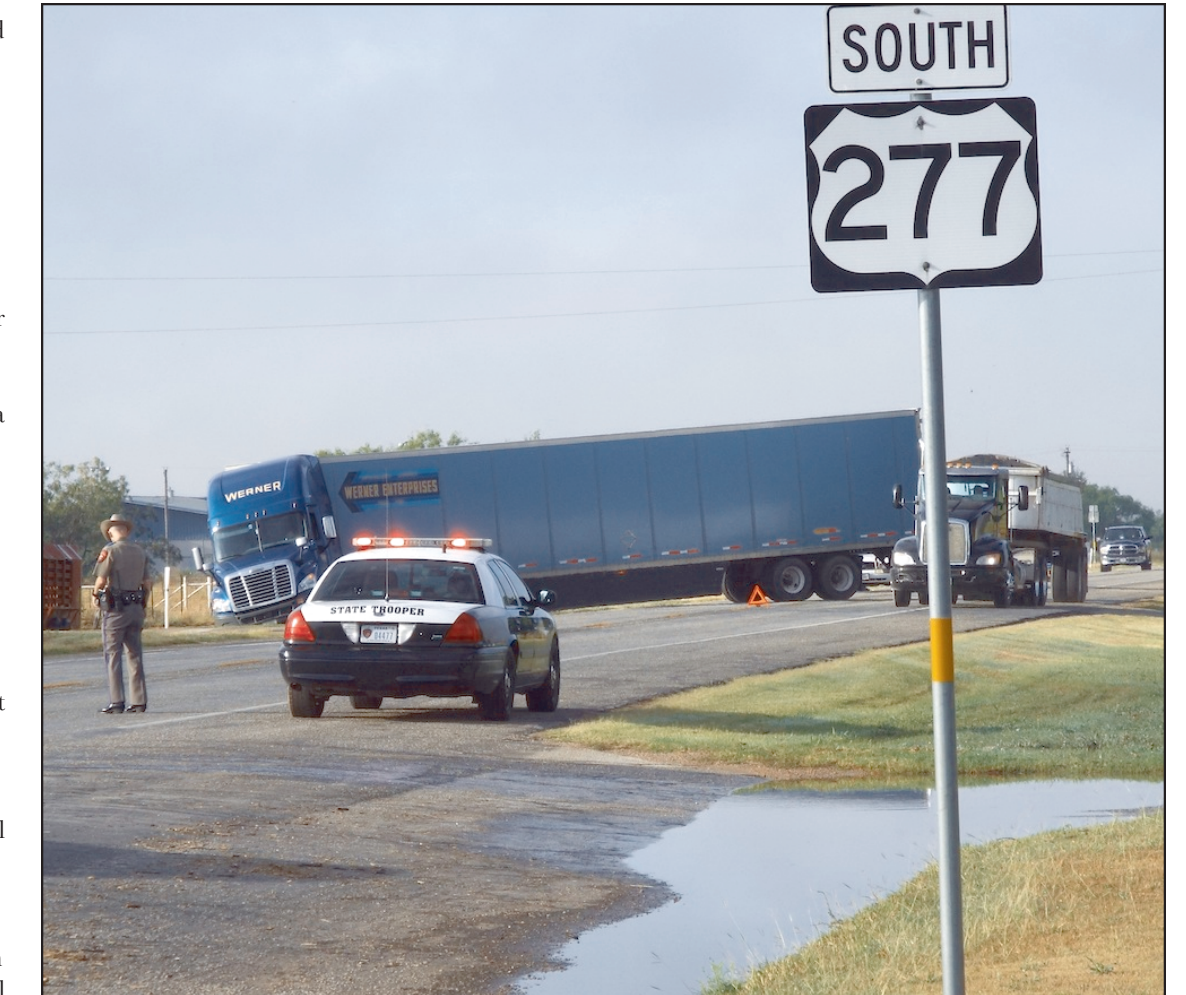
Uh Oh! It looks like this big rig may have missed his turn last week in Bronte! Things didn't go well for him and traffic attempting to travel on Highway 277 for quite awhile.