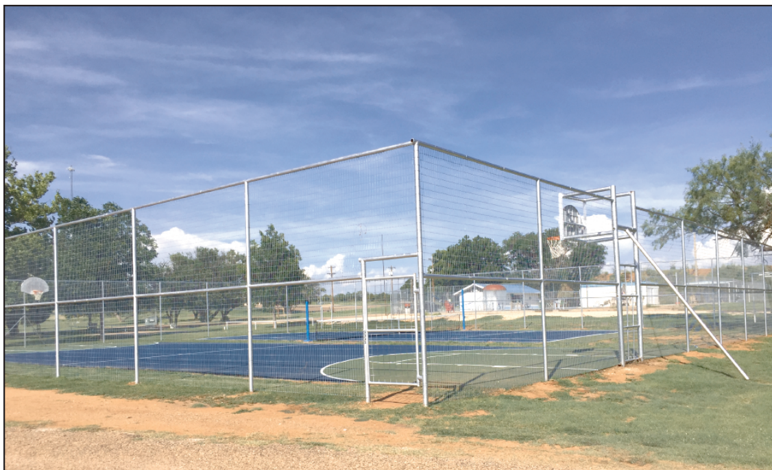
Basketball and Tennis Courts