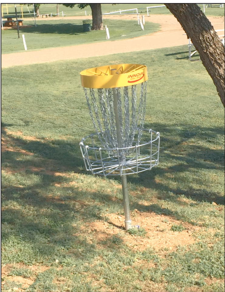
Disc Golf Basket