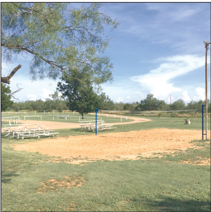
Sand Volleyball Court