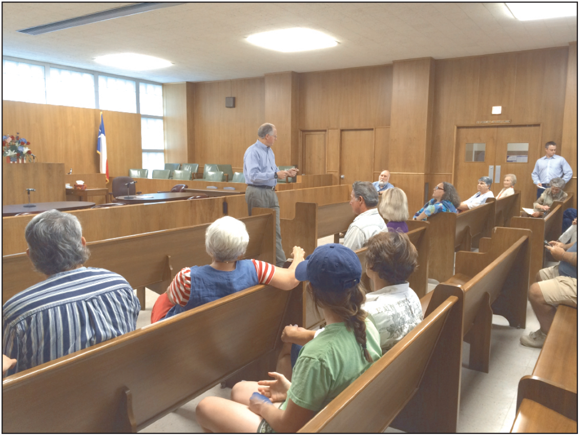
Conaway Visits! United States Congressman Mike Conaway visited with constituents in Robert Lee last Wednesday afternoon, June 29, 2016. The well attended meeting was a time for Rep. Conaway to give a congressional update and answer questions from voters. One informed voter from San Angelo attended every town hall meeting the congressman held that day and was quite vocal in the meeting.