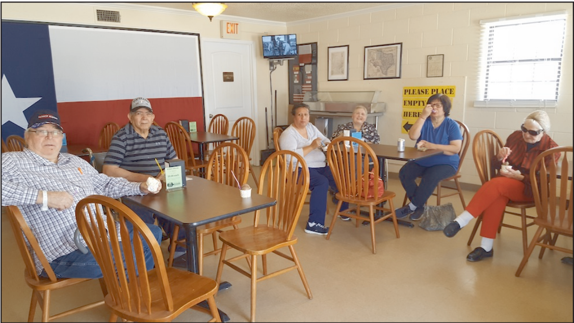
Ice Cream at The Pie! Bronte Health & Rehab Center residents are enjoying ice cream during a trip to The Pie Pizzeria in Robert Lee recently.

Bronte Housing Authority Community Room Bronte, Texas