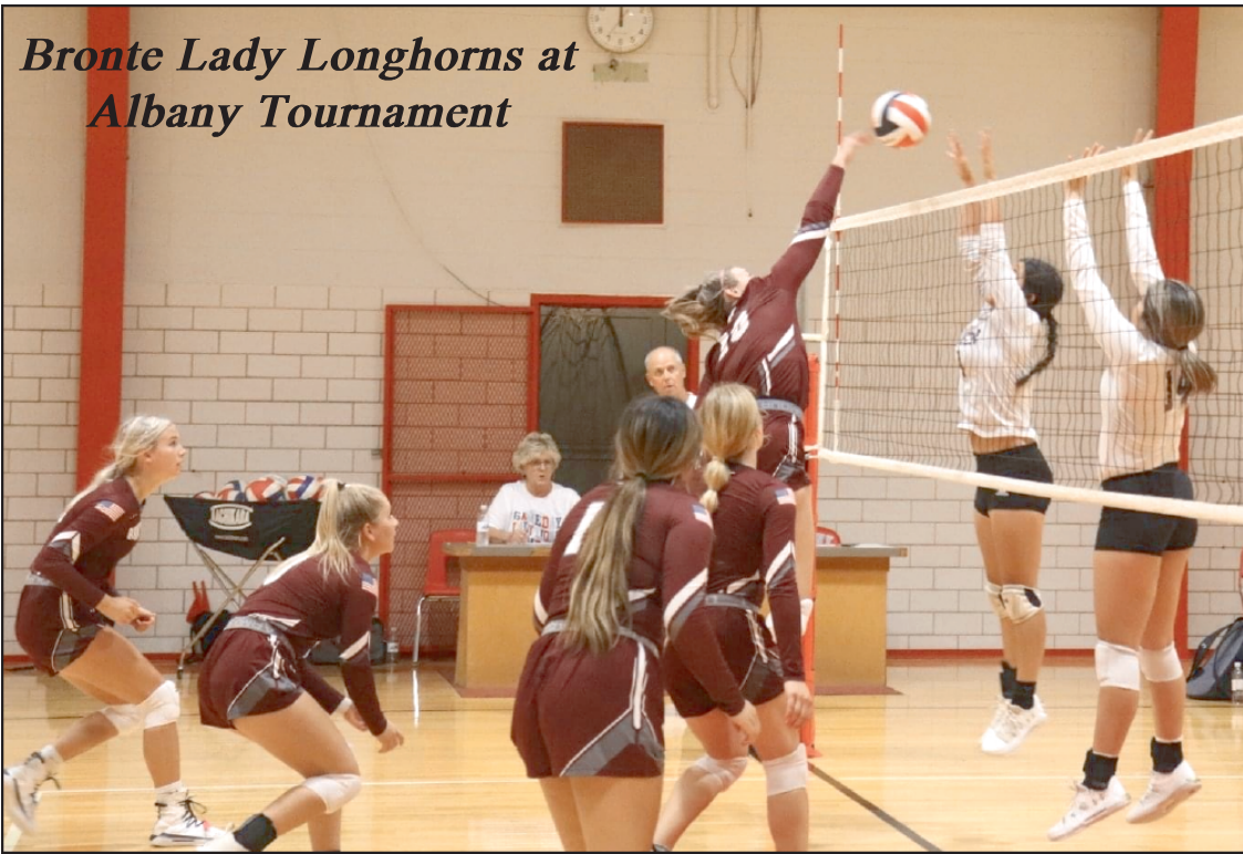
Bronte Lady Longhorns at Albany Tournament