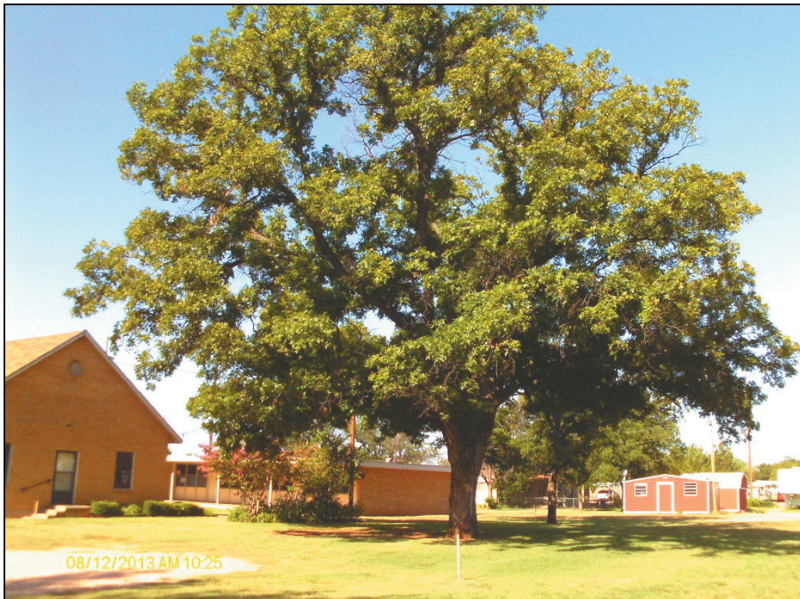
Landmark Tree! The historic pecan tree at the Bronte Methodist Church was taken down on August 12, 2013. Struck by lightning three years ago and held together with steel cables, the tree was taken down to make way for the Church's new Fellowship Hall and Food Pantry. The 70+ year old tree had become a safety concern after the lightning strike, but will remain a fond memory of church members and the community.