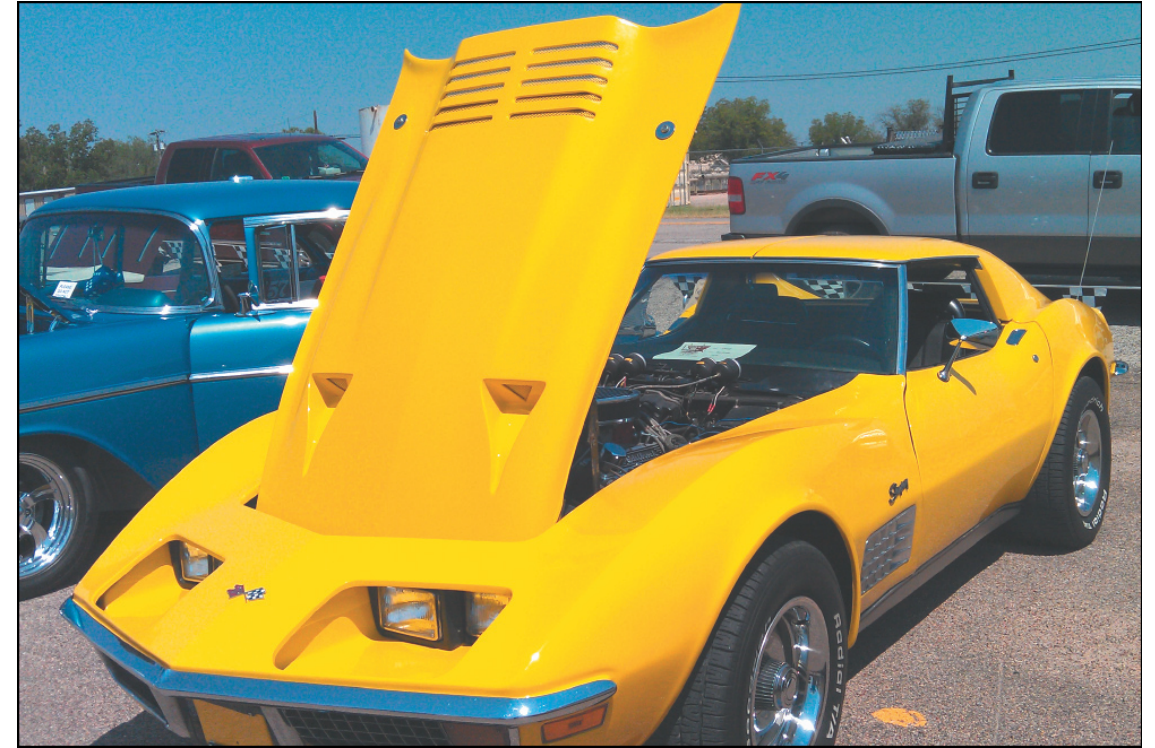
Oldies, but Goodies Car Show! The car entered by Todd Thornton of Abilene was named the Teen's Choice at this year's Oldies, but Goodies Car Show held last Saturday in Bronte.