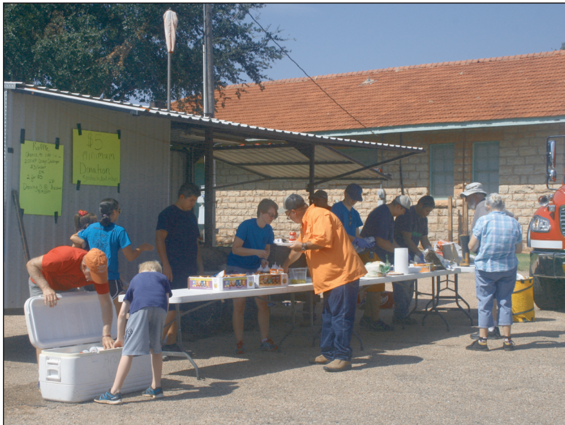
BBQ Lunch! The Bronte Volunteer Fire Department served barbecue to hungry visitors to the Oldies But Goodies Car Show held in Bronte on Saturday, August 19.