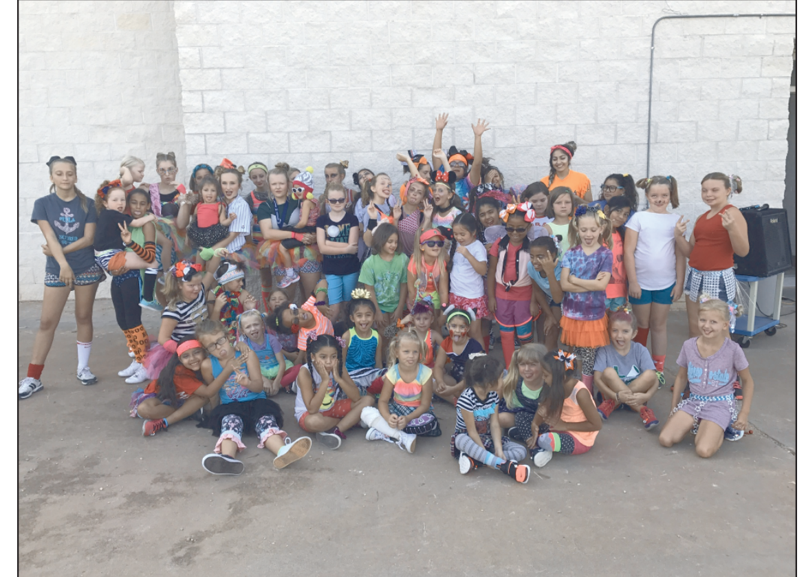
Cheer Camp! The Robert Lee High School Cheerleaders held a Mini-Cheer Camp recently. The children learned cheers, chants, sideline routines and dance. The campers will also perform at one high school pep rally and for 5 minutes during a home football game.

7. DISCUSS/APPROVE POLICY UPDATE 108, AFFECTING LOCAL POLICIES: EF (LOCAL): INSTRUCTIONAL RESOURCES, EFA (LOCAL): INSTRUCTIONAL RESOURCES INSTRUCTIONAL MATERIALS, EFAA (LOCAL): I N S T R U C T I O N A L MATERIALS - SELECTION AND ADOPTION, EHDB (LOCAL): ALTERNATIVE