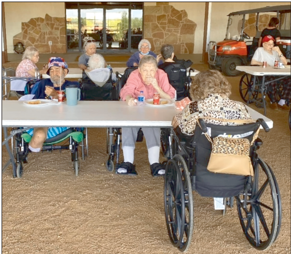
Fort Trip! Robert Lee Care Center residents and staff recently visited Fort Chadbourne. They enjoyed learning about this part of Texas history and the many artifacts. After their tour, a picnic lunch was held under the pavilion.

regulations for the 2022-23 season are available online at outdoorannual.com, or on the Outdoor Annual mobile app. The mobile app is free, and once downloaded, it works without internet connectivity which makes it easy for hunters and anglers to view regulations in even the most remote locations.