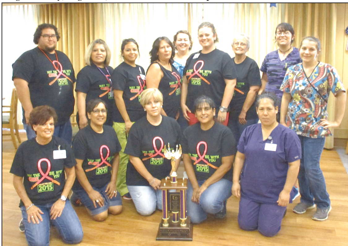
Relay For Life! Robert Lee Care Center participated in the 2015 Relay for Life on June 6, 2015. The Relay theme was “Lights, Action, Hope” and each team took on a movie related theme for the event. The Robert Lee Care Center Team picked a Star Wars theme, “May the Cure Be with You.” Each of RLCC’s more than 20 team members participated throughout the all-night event, winning multiple contests and prizes. The Robert Lee Care Center team raised more than $3,000 and won the “Top New Team” trophy. The team is grateful for the generosity and support of the community and will continue to raise awareness and funds throughout the coming months for Relay 2016.