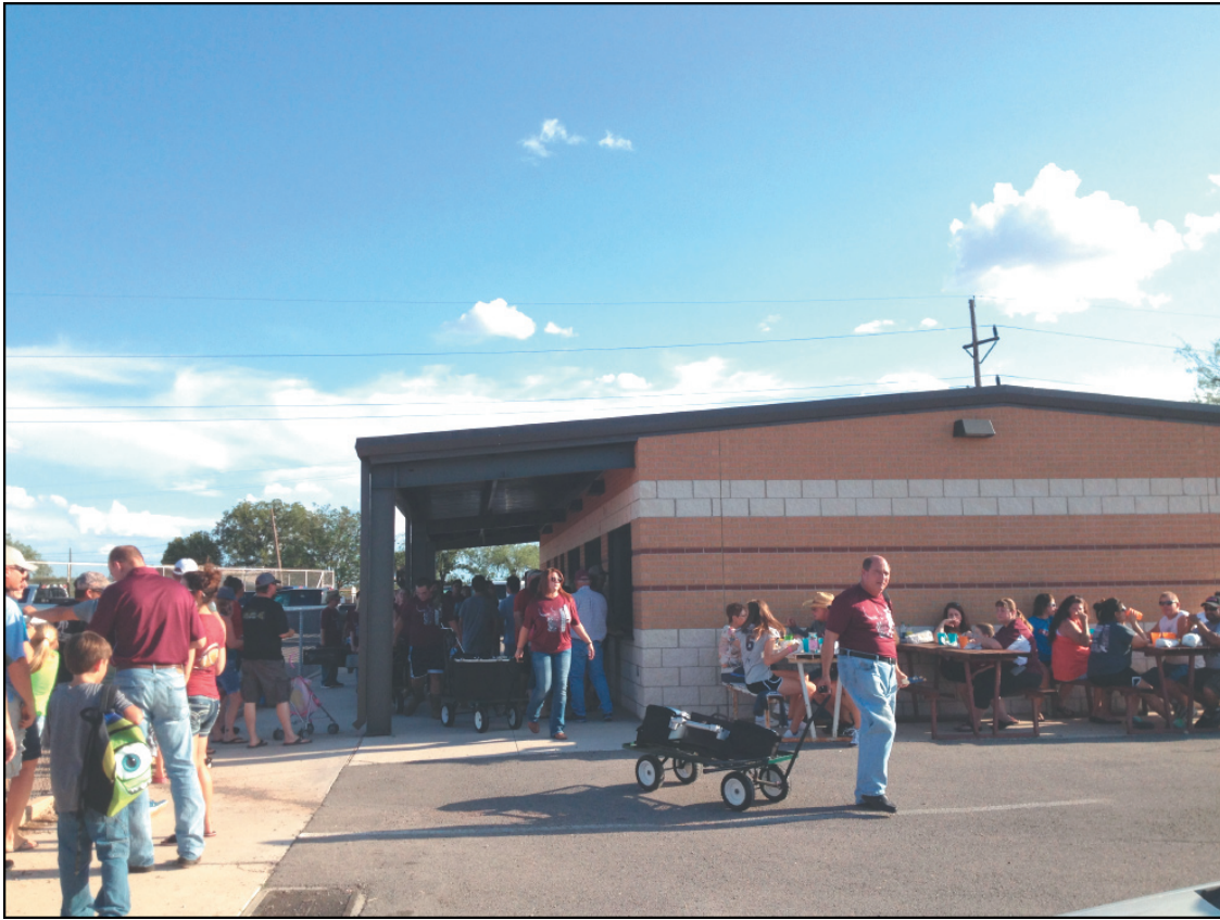
Meet the Longhorns! A nice crowd turned out last Thursday evening, August 22, 2013, to enjoy delicious hamburgers and Meet the Longhorns. The hamburger supper benefited this year's Project Graduation. The event was held at the BHS football stadium.