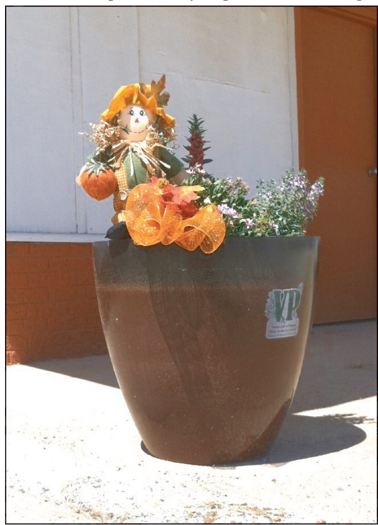
Pretty Planters! Members of Robert Lee's Vision with a Purpose were busy Tuesday morning adding fall decorations to the planters dotting Robert Lee's downtown area.

The Livestock Forage Disaster Program was made possible through the 2014 Farm Bill, which builds on historic economic gains in rural America over the past five years, while achieving meaningful reform and billions of dollars in savings for the taxpayer. Since enactment, USDA has made significant progress to implement each provision of this critical legislation, including providing disaster relief to farmers and ranchers; strengthening risk