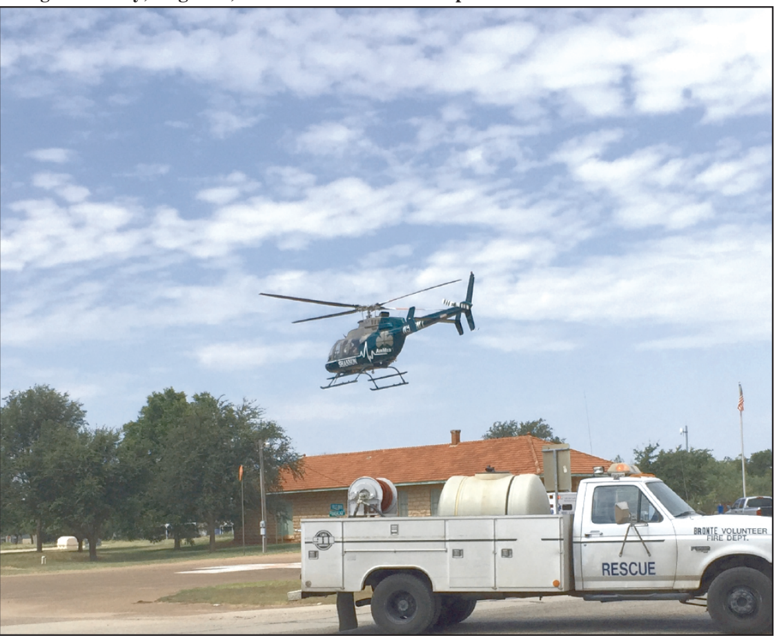
Medical Emergency! The Medivac helicopter rises into the air Monday morning, August 3, 2015, on its way to San Angelo. East Coke County Ambulance Service was called to a local residence just before 11 am and transported the patient to the helipad where members of the Bronte Volunteer Fire Department blocked roads and detoured traffic around the helipad area.