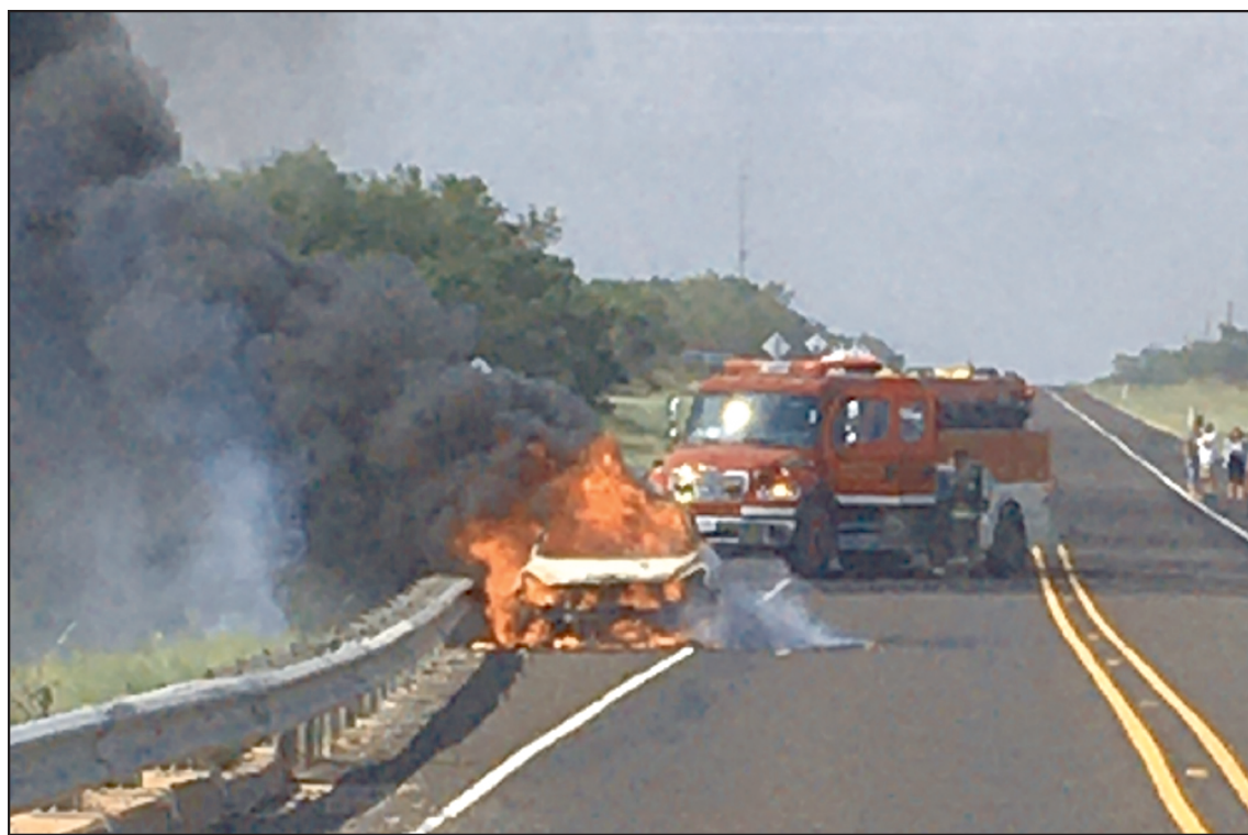
Fire! A car caught on fire last week while traveling south of Bronte on Highway 277 at the Colorado River bridge. The driver was able to get out of the vehicle unharmed. Bronte Volunteer Fire Department, Coke County Sheriff's Office, and Texas Department of Transportation worked to clear the scene.

distributed a schematic of what Jacob and Martin has been looking with various possibilities. The current plant location is limited using 50-year technology. They recommend building a new water plant closer to Oak Creek. If this is done, it will improve the intake facility and change out the 10" line to a 14" line to make sure that two million gallons a day could be done. If getting land near Oak Creek is not possible, then another alternative site along the railroad is a possibility. It is too early to make a commitment to any location unless a reasonable amount of grant money and funding is obtained. The project is currently in the preliminary stages. In the schematic it can be seen showing the water line going down 277 and it would be a treated line if the plant were to be located at Oak Creek. It would open possibilities to sell treated water to landowners on 277. In addition, Jacob and Martin would recommend putting a storage tank at the high spot just south of the interchange. The total project estimate is $12.5 million. That includes the plant, new intake, new lines, storage, and 8-10 miles of treated water pipeline. It is recommended to complete the grant application, however the City is not required to accept the grant if approved. Mayor Gohman distributed pictures of