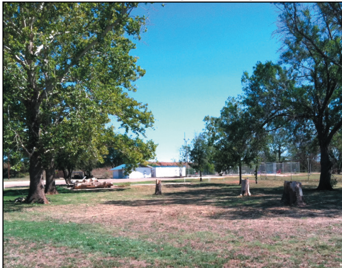
Bronte Park! Coke County crews began the process this week of cutting down the dead trees in the Coke County Park in Bronte.