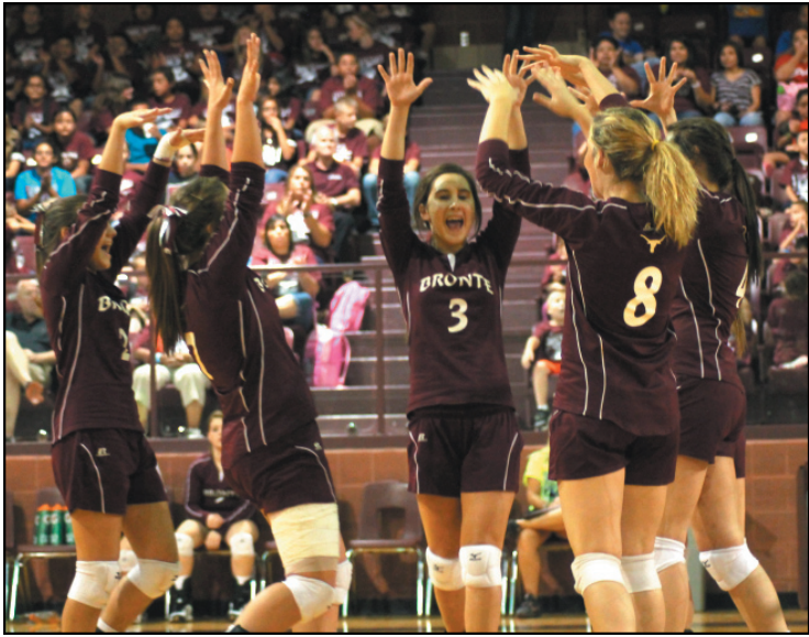
BHS Volleyball! Bronte High School hosted their "A" Showdown volleyball tournament last weekend. After pool play Friday, the Lady Longhorns made it to the championship division Saturday; losing to Wink in the 1st round.