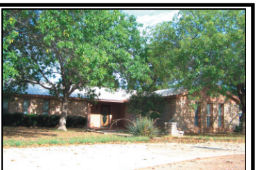
NEAR SCHOOL! This Beautiful Rock Home has massive beams & Stone Fireplace in Living Area! 3 Bedrooms 2 Baths & 2 Living Areas! Kitchen overlooks Living & Dining Area! Covered Patio, Carport & Storage!