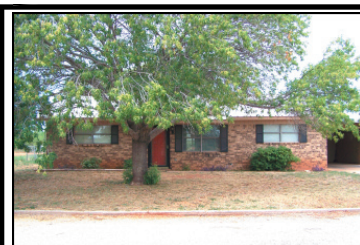
DRIFTWOOD ST. Brick Home with 3 Bedrooms & 2 Baths! French Patio doors lead to Covered Patio and fenced Backyard! HUGE Shop Building with roll up door and Covered Carport!

Bronte Health & Rehab Now Hiring for the following positions. LVN/RN Thursday, Friday & Saturday nights 10-6 Shifts Apply in person at : 900 S. State Street, Bronte, TX.