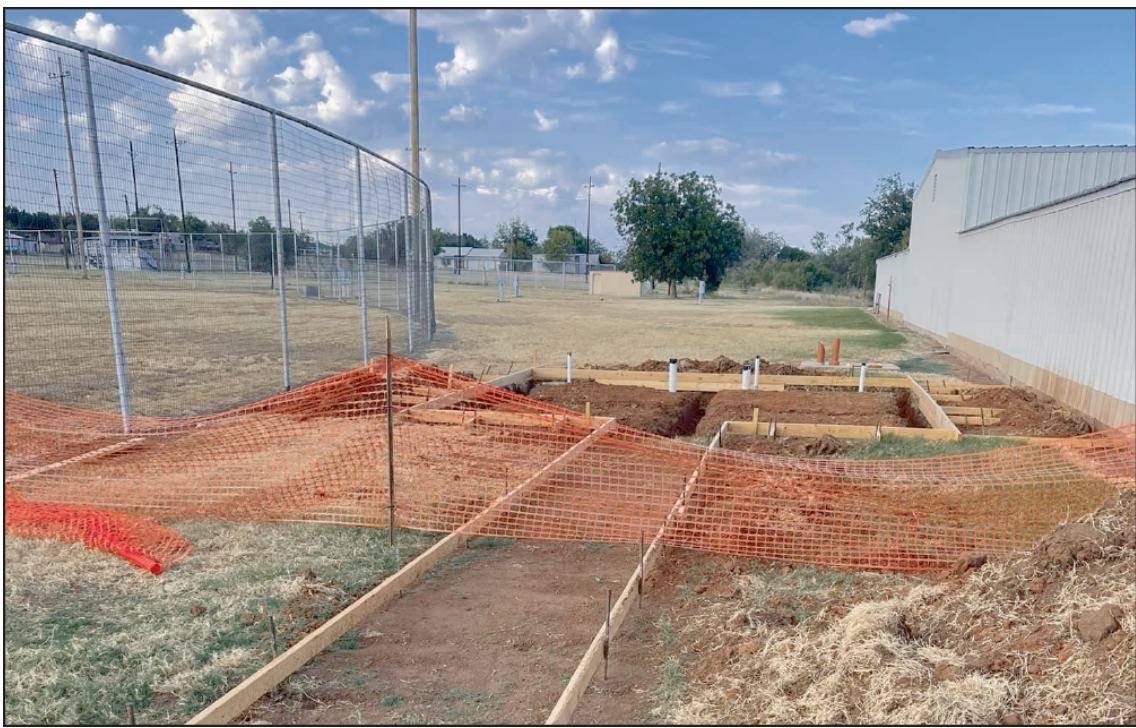
Progress at Park! The playground project, spearheaded by RL4Restoration, is coming along nicely. County employees have removed the old equipment to ready the area for the new playground equipment. The new bathrooms (pictured above) are plumbed and ready for concrete and electrical work.

Per Year in Coke County ... $30.00 Per Year Elsewhere in Texas ... $35.00 Per Year Outside of Texas ... $37.00