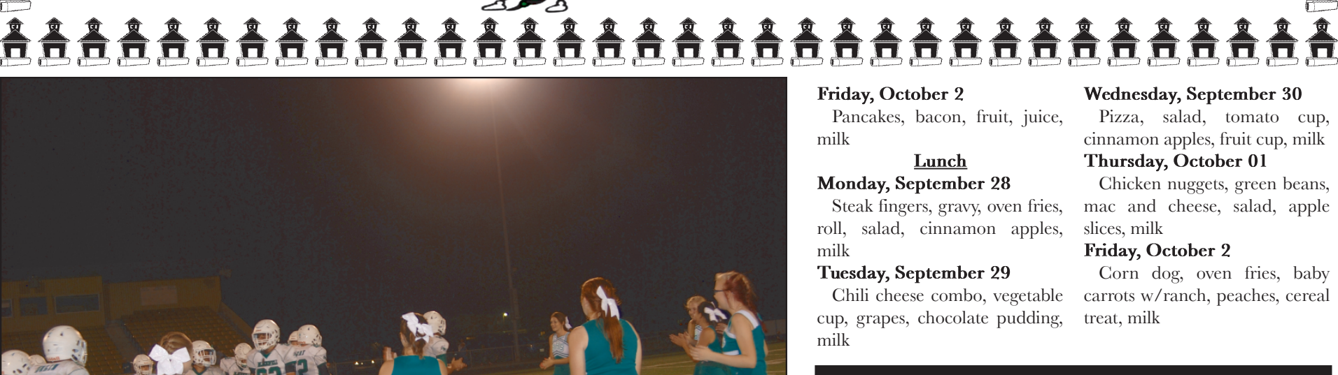
Postgame Gelebration! The Blackwell Hornets football team and cheerleaders celebrate their 58-8 victory over Westbrook on Friday, September 11, 2015.