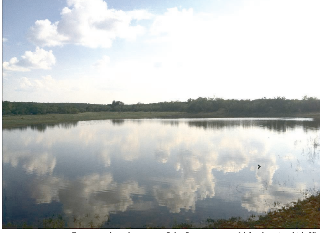
Welcome Rain! Farmers and ranchers across Coke County are grateful for the rain which filled many of the county's stock tanks to overflowing. Totals ranged from around 2" to over 6". The above tank is southeast of Robert Lee where 6" fell the end of last week.

When signing up you must let them know if a cart is needed and leave a call back number. For more information, contact Bronte Longhorn Golf Club at 325-473-2156, 325-473-3231 or