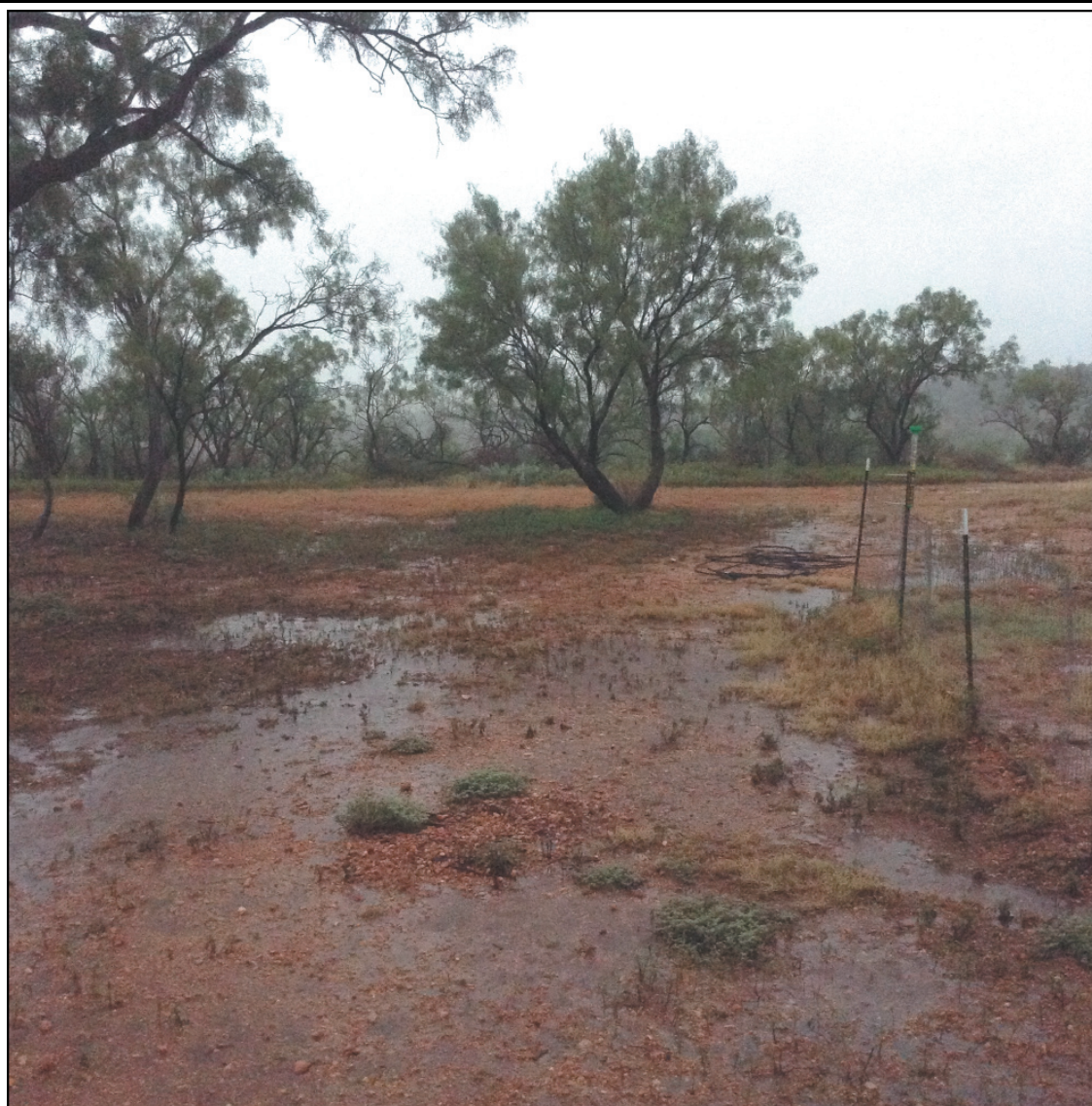
Welcome Rain! Coke County was blessed with slow falling showers the end of last week. Rain totals ranged from 2.25" near Robert Lee to 4.6" east of Bronte. The average county-wide was approximately 3.5".

The Old Coke County Jail will be open for a tour during the October 5 Street Affair. From 9 am to 12 noon, visitors can see how far the preservation project has come. Some "before" pictures will be on view to