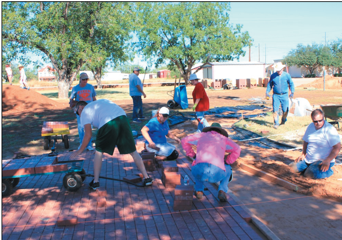
Coke County Memorial Garden! Members of Robert Lee's Vision with a Purpose have been busy this last week laying the commemorative bricks at the Coke County Memorial Garden on the lawn of the Coke County Courthouse.