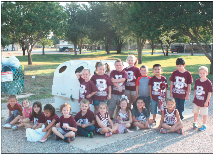
Bronte Kindergarten! The Bronte Kindergarten Class has been learning about natural resources and how they can protect the environment. The students have been recycling, reusing, and reducing in their classroom. On Friday, September 13, the students walked to Bronte's recycling center.